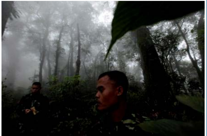
Indonesian soldiers, part of a rescue team, take a break as they search for the wreckage of a Russian Sukhoi aircraft near Bogor, Indonesia.

out an initial timetable of just under a month to win control. The offer to buy all the outstanding shares in the biotechnology company will expire at 12:00 midnight New York time on June 7, unless it is extended, GSK said in a brief statement. Since GSK's interest was made public three weeks ago, more than 207 million shares in Human Genome have traded, representing 104 percent of the shares, Reuters data shows. As a result, an estimated 25 to 30 percent of the stock is now owned by arbitrageurs hoping to cash in on the pending deal, according to one person familiar with the situation.